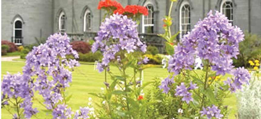
Inveraray Castle Gardens

The Victorian legacy ensures that presently Ardkinglas boasts many Champion Trees (the tallest or broadest of their species within the UK)